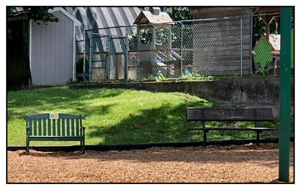
A 'Trex' bench of plastic materials compiled by our members installed at the Chestnut Avenue Park in Bensalem