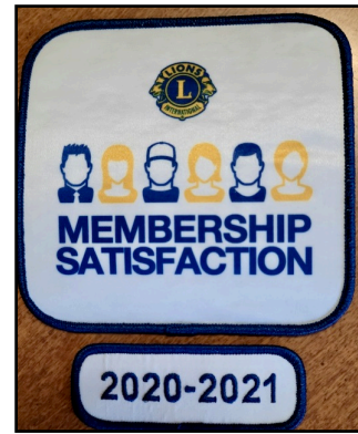
LCI's recognition - Membership Satisfaction Banner Patch for FTL