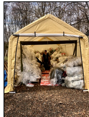
The Vasek's Recycle Tent