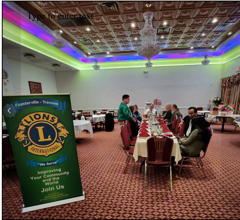
Scenes from our December 20 Holiday Party at the Shagun Restaurant in Bensalem A fun-time and enjoyable meal for all.