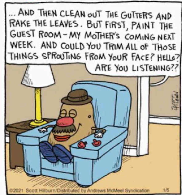
The Argyle Sweater by Scott Hilburn

Q: What's the difference between a cougar and a leopard? A: A leopard can drag something twice its weight up a tree. A cougar can drag something half her age into bed.