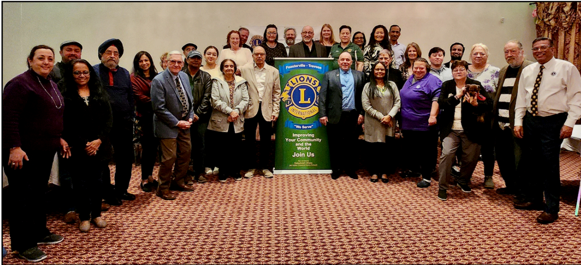
Group view of Lion members, spouses & relatives and guests

√ On March 18th, we sponsored an event at Shagun Restaurant in Bensalem to raise approximately $4,000 for victims of recent earthquakes in Turkey and Syria. This under the umbrella of LCI.