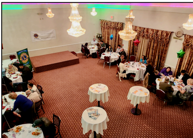
Bird's Eye view of dining area